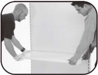
Make sure layer panel to be place well and be horizontal