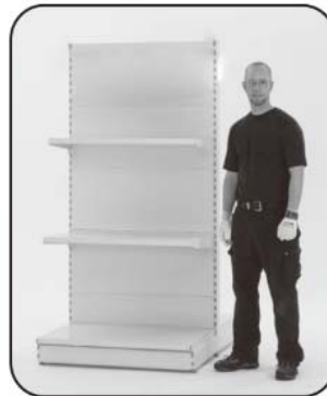
Continue to install layer panels do as Step 9 and 10.