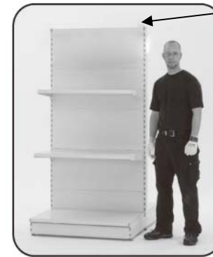
Install top panel and fix it screws(one left and one right)