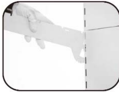
Choose appropriate place to install brackets(one left and one right)