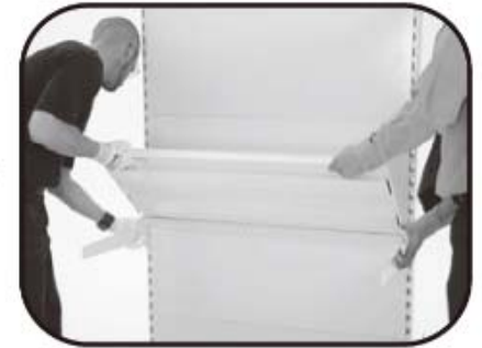
Put layer panel on brackets